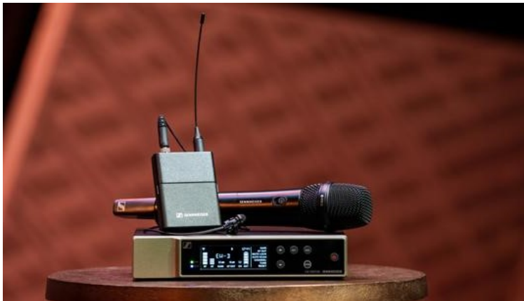
Evolution Wireless Digital offers easy, app-controlled wireless

channels can be accommodated in a given frequency window. The systems have exceptional specs in every detail, be it a low latency of 1.9 milliseconds and a transmitter battery life of up to 12 hours with the BA 70 rechargeable battery pack, or the bandwidth of 56 MHz with up to 90 channels per band, which makes it easy to find space even in crowded RF environments.